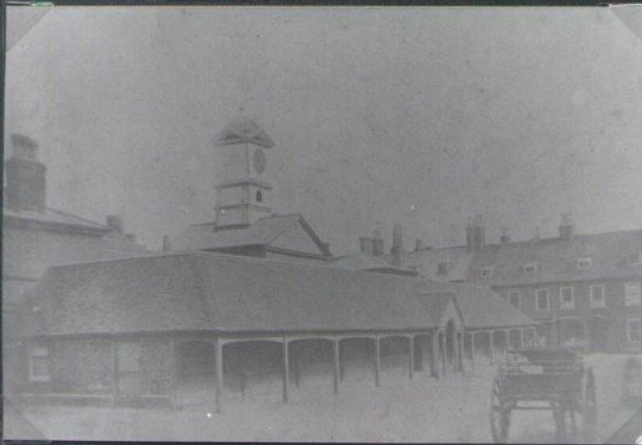
View of The Shambles, shops and horse and cart.