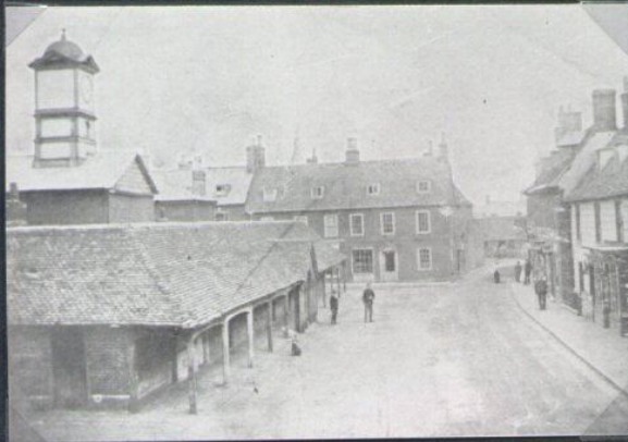
Potton Market Square - looking towards Brook End.

Right: Note the modern view looking towards the Forge Garage, Brook End. Compare the windows of the former butcher's shop and those of Regents Chinese Cuisine.