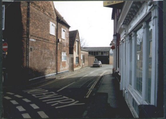
Brook End in April 1995