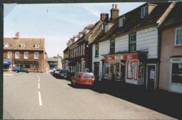
1994. The Forge Garage stands on the site of the Blacksmith's Shop. Cox's News is run by K.P.Newsagents.