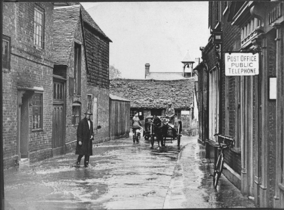
March 1947. Flooding as a result of melting snow.