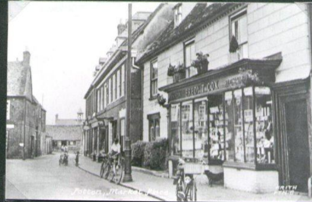
View into Brook End: note the Blacksmith's shop. Mr.F.T.Cox took over the Newsagent's business from Mr.Richard Elphick in 1940.