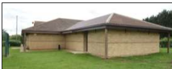
Annex to Mill Lane Pavilion completed 2017

The Society has suspended its monthly programmes and its archive meetings. The room at the Mill Lane Pavilion is normally a hive of activity on Monday mornings but will need to remain closed until the C-19 Virus outbreak subsides. We intend to keep members and others in touch with 'at-home' work we are carrying out and also suggest ways in which you can pass the hours in home confinement.